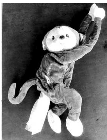
Monkey sneeze, monkey doo: This week's second prize.

The Style Conversational: The Empress's weekly online column reviews each new contest and set of results. Check it out at wapo.st/conv1369 .